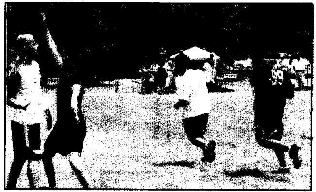
The local Ultimate Frisbee club demonstrated their sport in the center of the Green at the dedication. Frisbee is a perfect activity for which the Green was developed.