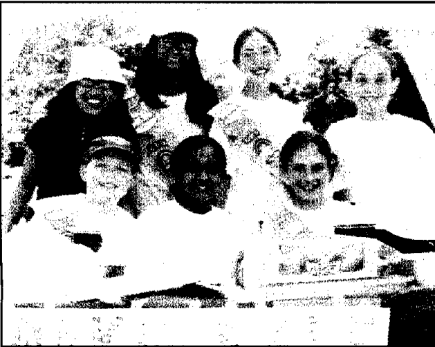
Girl Scout troop 465 held a bake sale with proceeds to benefit improvements to the park, and hopefully a new bocce set for the planned bocce court.