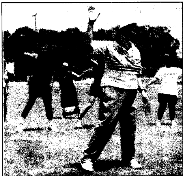
Power of One, a local exercise establishment led an exercise demonstration on the Green.

Throughout the day, activities were held exemplifying the various community uses for the Green. Local business proprietor, Power of One, conducted an exercise class on the Green, followed by an Ultimate Frisbee demonstration by a community team. Free food and drink generously provided by area eateries where avail-