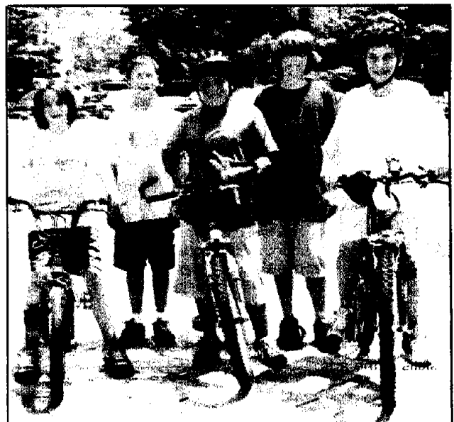
On the day of the dedication, despite scorching heat, local kids biked in for the festivities. Biking is one activity that can be enjoyed in the park.

Bank of America led the generous business donations with a $10,000 check. Thus far, the LVGA has raised $60,000 of a projected $100,000 to make superior improvements to the park.