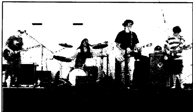
The popular local band, Delayed Reaction, entertained park goers at the Lincroft Village Green dedication

able through the event along with face painting, caricature drawings and various games.