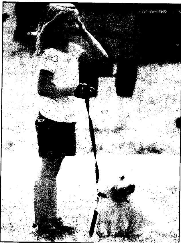
The Lincroft Village Green was envisioned as a quiet, beautiful spot to stroll, walk your dog, bike and just sit and watch the grass grow.

able through the event along with face painting, caricature drawings and various games.